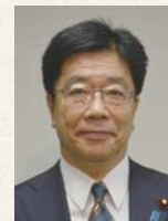
Katsunobu Kato Minister in charge of the Abduction Issue

Direct from Exit C4, Kasumigaseki Station on the Tokyo Metro Hibiya Line and Chiyoda Line; 5-min walk from Exit B2, Kasumigaseki Station on the Marunouchi Line; 3-min walk from Exit 9, Toranomon Station on the Ginza Line; 10-min walk from Exit 5, Sakuradamon Station on the Yurakucho Line; 10-min walk from Shimbashi Station on the JR Yamanote, Keihin Tohoku, Tokaido, Yokosuka, Toei Asakusa, and Yurikamome Lines; 3-min walk from Exit A7, Uchisaiwaicho Station on the Toei Mita Line