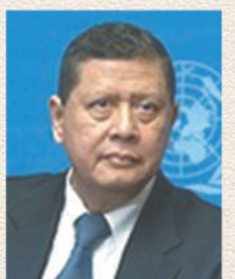
Mr. Marzuki Darusman UN Special Rapporteur on the Situation of Human Rights in the DPRK (video message)

Please visit ► https://www.omc.co.jp/abductees/en/tokyo2015/