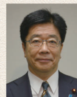
Katsunobu Kato Minister in charge of the Abduction Issue

Direct from Exit C4, Kasumigaseki Station on the Tokyo Metro Hibiya Line and Chiyoda Line; 5-min walk from Exit B2, Kasumigaseki Station on the Marunouchi Line; 3-min walk from Exit 9, Toranomon Station on the Ginza Line; 10-min walk from Exit 5, Sakuradamon Station on the Yurakucho Line; 10-min walk from Shimbashi Station on the JR Yamanote, Keihin Tohoku, Tokaido, Yokosuka, Toei Asakusa, and Yurikamome Lines; 3-min walk from Exit A7, Uchisaiwaicho Station on the Toei Mita Line