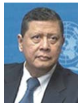
Marzuki Darusman Former UN Special Rapporteur on the Situation of Human Rights in the DPRK