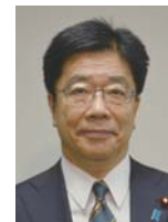
Katsunobu Kato Minister in charge of the Abduction Issue