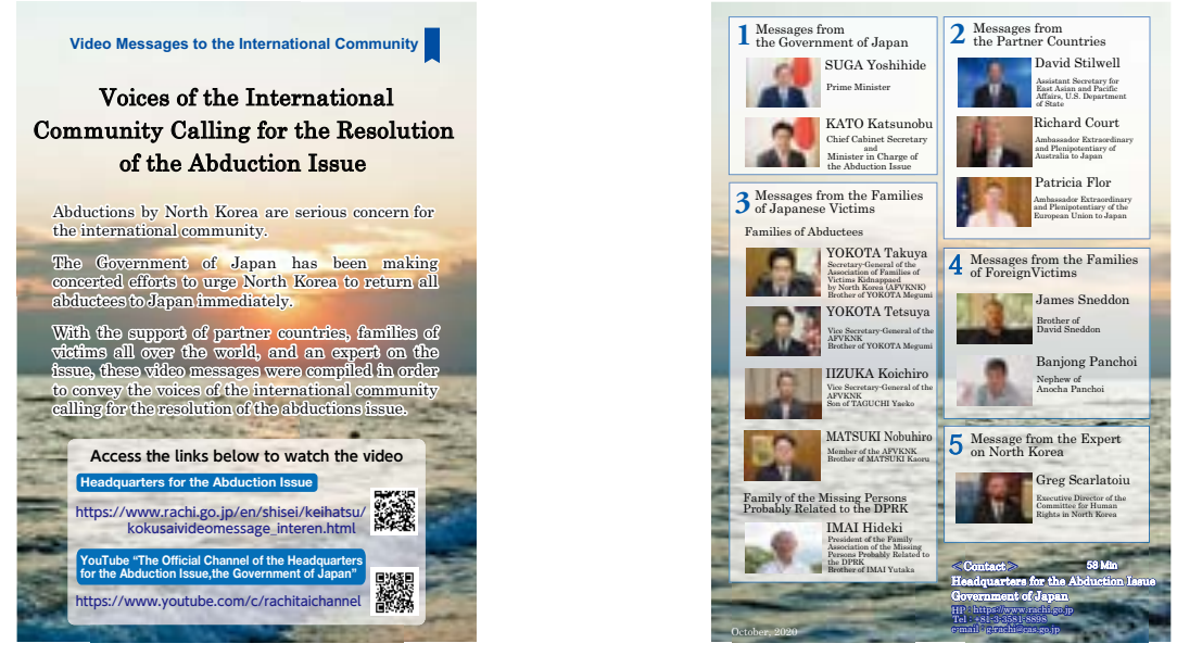
Video Messages to the International Community,

In October 2020, with the determination not to stall the efforts of the international community to resolve the abductions issue by North Korea, even while COVID-19 is raging globally, the GoJ released the video messages, "Voices of the International Community Calling for the Resolution of the Abduction Issue," with the support of international partners, families of victims all over the world, and an expert on the issue.