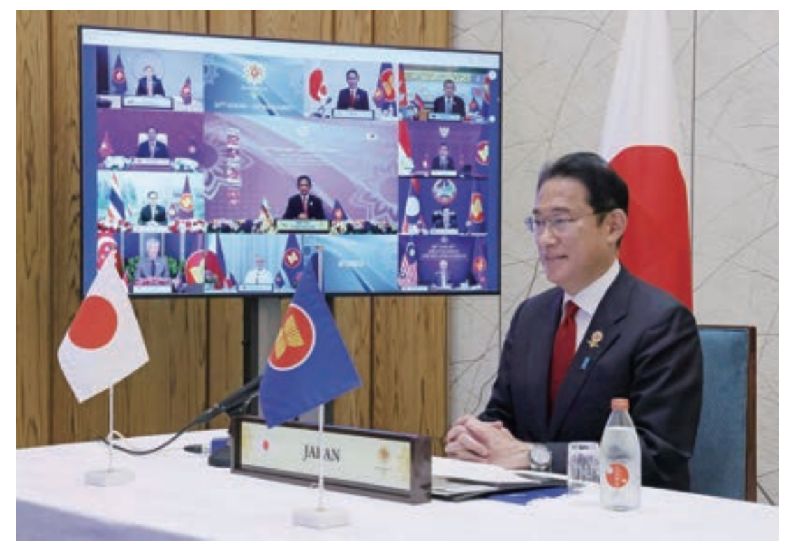
ASEAN-Japan Summit Meeting (October 2021)

Furthermore, in the ASEAN-related Summit meetings in October 2021, Prime Minister Kishida asked for the continued understanding and cooperation of each country towards the immediate resolution of the abductions issue. Prime Minister Kishida obtained their support for the resolution of the abductions issue, and as a result, reference to the importance of the immediate resolution of the abductions issue was included in the Chairman's Statement.