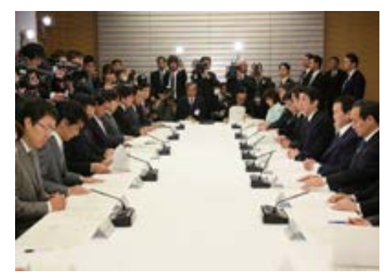
The First Meeting of the Headquarters for the Abduction Issue (January 2013)

In January 2013, the GoJ established a new "Headquarters for the Abduction Issue" consisting of all Ministers of State, in order to discuss measures to address the abductions issue and to promote strategic approaches and comprehensive measures for the resolution of this issue. The Headquarters is led by the Prime Minister serving as the head, and the Minister of State for the Abduction Issue, the Chief Cabinet Secretary, and the Foreign Minister serve as the deputies. Individual Ministers closely collaborate with mainly the head and deputies and exert themselves to the utmost of their ability in their respective fields of responsibility towards the goal of resolving the abductions issue.