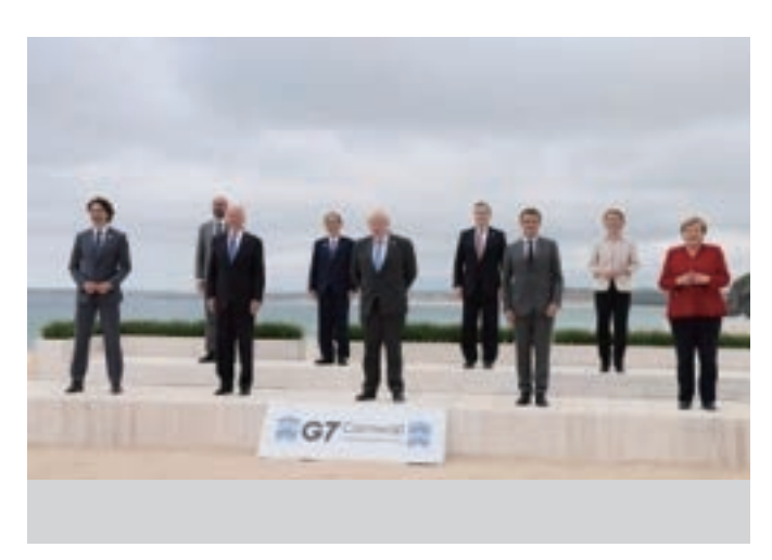
G7 Cornwall Summit (June 2021)

In addition, at the Japan-Australia-India-U.S. Summit Meeting in September 2021, then Prime Minister Suga asked for the leaders' understanding and cooperation towards an immediate resolution of the abductions issue, and gained