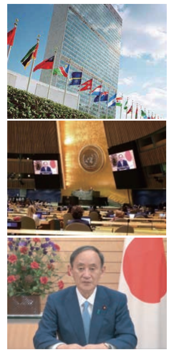
Mr. Suga, then Prime Minister of Japan, during the speech at the General Debate Session in the UN General Assembly (September 2021)

The resolution adopted by the UN General Assembly in December 2020, stresses with grave concern the urgency and importance of the issue of international abductions and of the immediate return of all abductees, expresses grave concern about the long years of suffering experienced by abductees and their families, and the lack of positive action by North Korea, notably since the investigations on all the Japanese