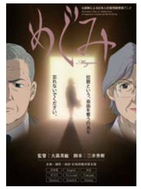
MEGUMI (Japanese animation)

the responsibilities of the GoJ in resolving the abductions issue, this law holds national and local governments responsible for raising awareness of the issue and to this end establishes North Korean Human Rights Abuses Awareness Week (December 10 - 16), which calls on national and local governments to hold educational events on the topic during this week. The GoJ also distributes pamphlets and posters, screens movies and cartoons which raise awareness about the abductions issue, dispatches personnel for workshops and other educational events, hosts essay contests for junior high and high school students, holds training for teachers, university students aspiring to become teachers and others, broadcasts radio programs (in Japanese and Korean) to North Korea and holds arts performances aimed at raising awareness of the issue, etc. In particular, during North Korean Human Rights Abuses Awareness Week, many conferences and symposia, etc. are held by governments and NGOs to advocate the resolution of the abductions issue both inside and outside of Japan.