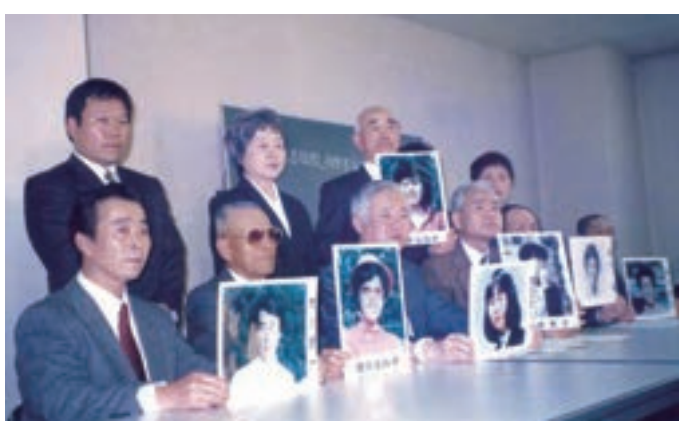
The Formation of the Association of Families of Victims Kidnapped by North Korea

The abductions by North Korea are a critical issue concerning the sovereignty of Japan and the lives and safety of Japanese citizens. It is a highly pressing issue that must be resolved under the state responsibility of the national GOJ. The GoJ has so far identified 17 Japanese citizens, including the five that