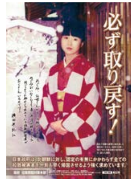
Posters distributed nationwide

In October 2020, with the determination not to stall the efforts of the international community to resolve the abductions issue by North Korea, even while COVID-19 is raging globally, the GoJ released the video messages, "Voices of the International Community Calling for the Resolution of the Abduction Issue," with the support of international partners, families of victims all over the world, and an expert on the issue.